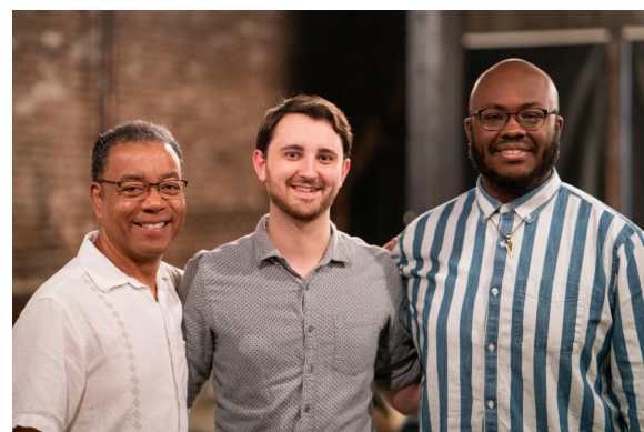
The cast of "'Master Harold'... and the Boys" in rehearsal